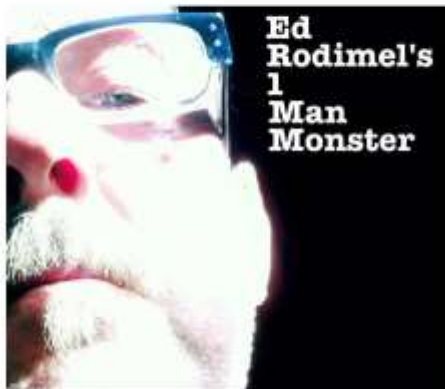
1 Man Monster will start at Noon