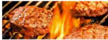
Jasper County Pork Burgers