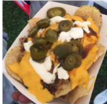
Pulled Pork Nachos