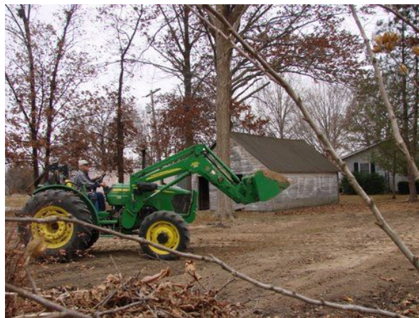
Bob Helregel moves dirt on the south side of the house.