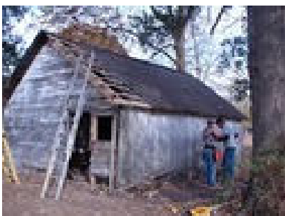
The barn roof is repaired.