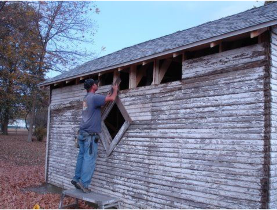
Repairing the south side of the garage. Rotten siding had to be replaced.